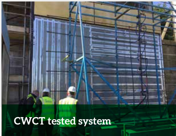
CWCT tested system

Can be used both horizontally and vertically