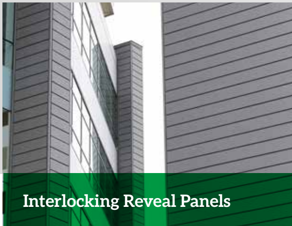
Interlocking Reveal Panels

“Mechanically notched corners, for perfect quality every time.”